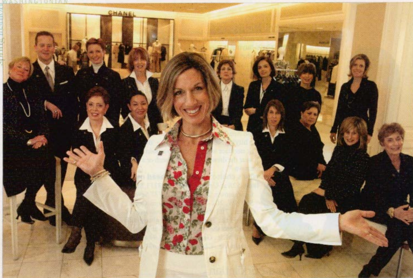
Photograph by Michael Ventura